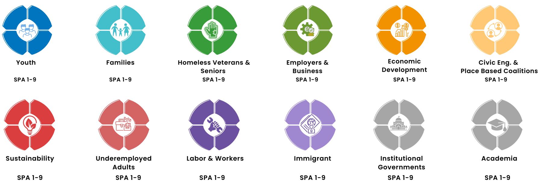
TABLE PARTNER LEADS