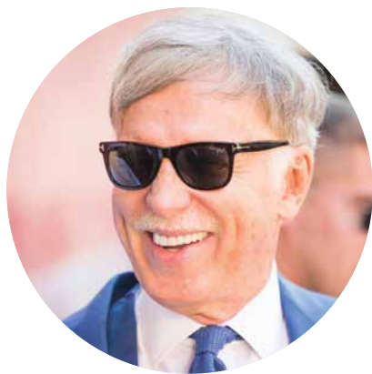
MR. STAN KROENKE Chairman & CEO, Kroenke Sports & Entertainment and CEO & Owner, Los Angeles Rams

Stan Kroenke, alongside his Los Angeles Rams and SoFi Stadium and Hollywood Park, are the 2022 Eddy Awards corporate honoree for their powerful commitment to, and impact on, the future of Los Angeles County.