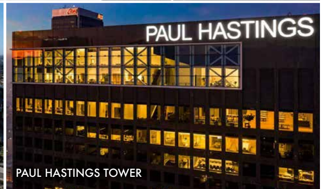
PAUL HASTINGS TOWER