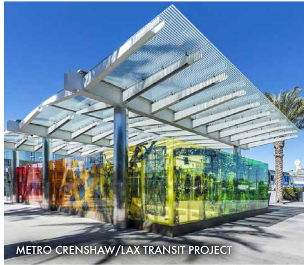
METRO CRENSHAW/LAX TRANSIT PROJECT