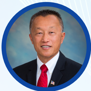
GEORGE K. CHEN Mayor | City of Torrance