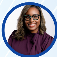
YASMIN-IMANI MCMORRIN Former Mayor & Current Councilmember City of Culver City