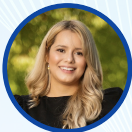
SCARLET PERALTA Former Mayor & Councilmember City of Montebello