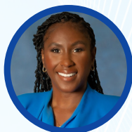
CASSANDRA C. CHASE Vice Mayor City of Lakewood