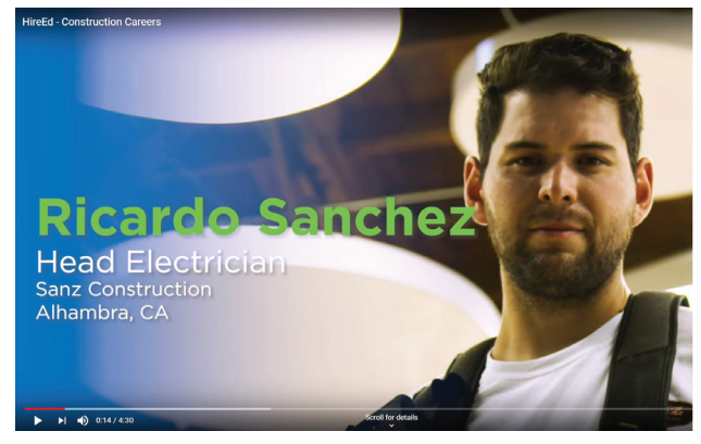
A scene from the HireEd video series

Propel L.A. (aka: LA County Strategic Plan for Economic Development (2016–2020)), a division of LAEDC, is completing a video series, titled: HireEd, in partnership with CCW and the L.A. County Office of Education. The series introduces high school students to high-growth and –paying careers and occupations with firms in the LA region. Each video showcases two "Millennial" professionals filmed at their workplaces, highlighting the community college attended, and clearly describes the education pathway taken.