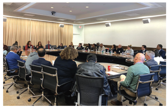
CCW hosted numerous industry council events to connect faculty with industry and other stakeholders.

he industry councils are held quarterly for each target industry to enhance and scale industry participation and participation with the community colleges. The councils are a venue to create and support partnerships with industry that enable more purposeful utilization of industry insight for program management, course development and the identification of talent development issues and trends. Industry councils also provide a platform for regional industry engagement to validate individual curriculum and training needs, to network and formalize informational and transactional (e.g., WBL, career) relationships, and to learn about industry resources and other shared opportunities. A summary of the seven industry councils are provided below: