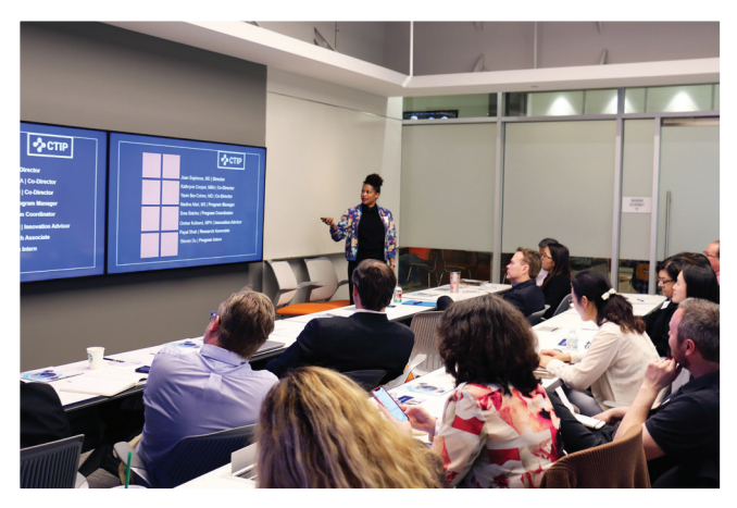
A meeting of the Bioscience Council connected industry executives with college representatives

research institutions and life science companies across the state. Anecdotally, representatives from some of the community colleges in attendance have said that they found great value in networking with industry partners at these council meetings, which provide a dynamic venue in which to better understand the industry's trends, ask questions and receive input from bio-based businesses re their supply and talent development needs; information that is, of course, useful in program and curriculum development.