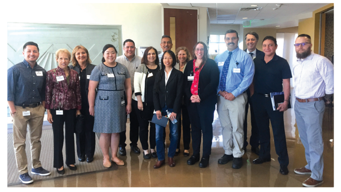
Community college representatives tour Takeda's facility

Takeda graciously provided several managers from human resources, bio-manufacturing/processing, and research and development to answer questions