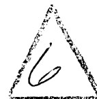
EXHIBIT NO. 01