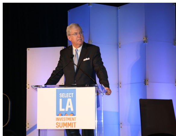
2016's SELECT LA Investment Summit at JW Marriott