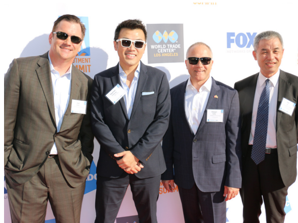
2016's Welcoming Reception at Fox Studios